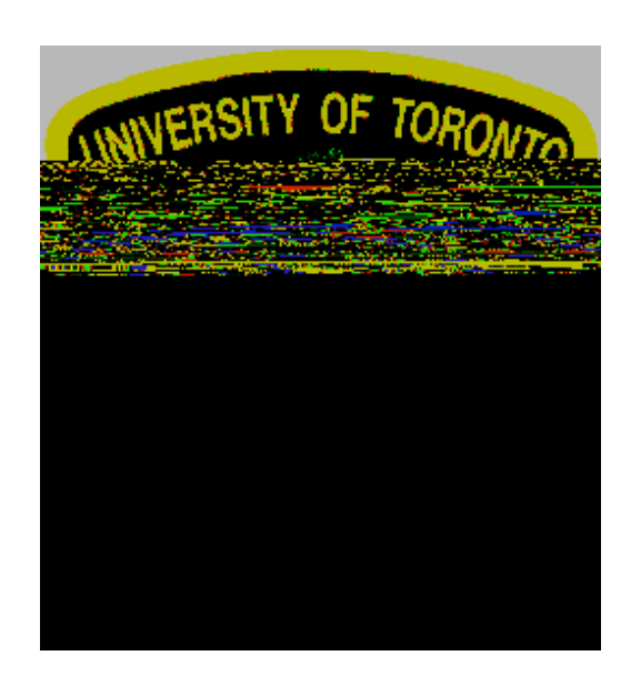
A Special Constable Service